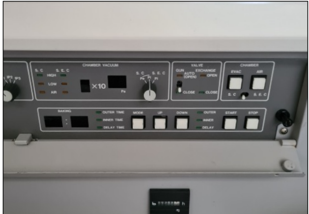
panel right side