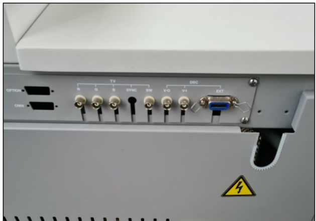
Video I/O (HV tank)

This data sheet is provided to you on a strictly confidential basis and contains commercially sensitive and valuable information. No part of its content may be provided to any person without our prior written consent. This data sheet is not an offer capable of acceptance. The information contained in this data sheet is, to our knowledge and information, accurate, but it may contain typographical errors and we do not warrant the completeness or accuracy of the information contained herein. Any offer by you to purchase of the equipment described in this data sheet shall be subject to our standard terms and conditions of sale. The Equipment being quoted is described as used, and is being sold "AS IS, WHERE IS" with all defects, known or unknown, entirely at Buyer's own risk and reliance solely upon Buyer's own inspection of the goods and without reliance upon any representation or description by Seller or seller's representative concerning the goods.