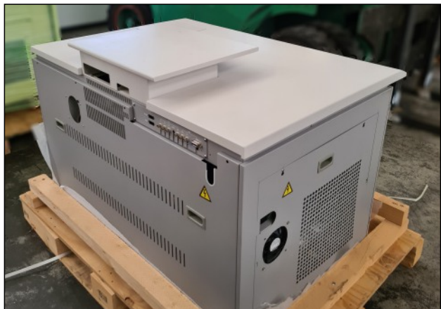
HV tank, video I/O

This data sheet is provided to you on a strictly confidential basis and contains commercially sensitive and valuable information. No part of its content may be provided to any person without our prior written consent. This data sheet is not an offer capable of acceptance. The information contained in this data sheet is, to our knowledge and information, accurate, but it may contain typographical errors and we do not warrant the completeness or accuracy of the information contained herein. Any offer by you to purchase of the equipment described in this data sheet shall be subject to our standard terms and conditions of sale. The Equipment being quoted is described as used, and is being sold "AS IS, WHERE IS" with all defects, known or unknown, entirely at Buyer's own risk and reliance solely upon Buyer's own inspection of the goods and without reliance upon any representation or description by Seller or seller's representative concerning the goods.