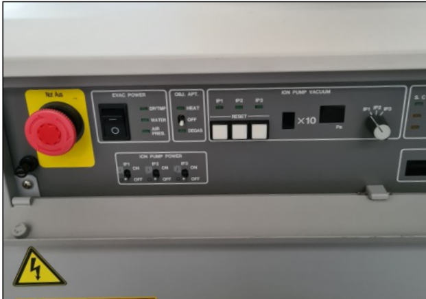
panel left side